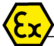
Dimensions 15 J