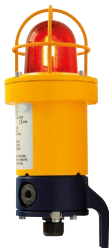
Flashing lamp 15 J