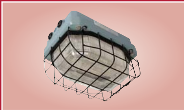
VL35 with wire guard