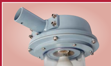
/SE Spigot mount version